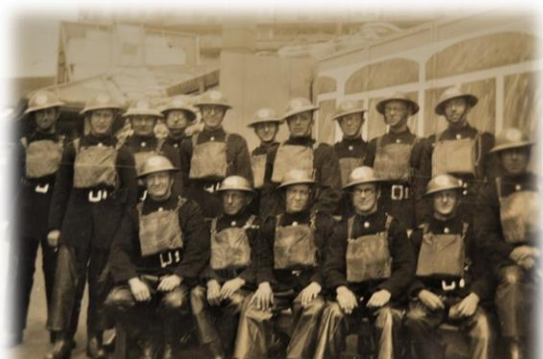
Southend Pier Staff in the AFS, 1941

As our visitors enter the Pier at the Pier Hill entrance they will be met by the guns and members of the Shoeburyness Royal Artillery Association before passing through the HMS Leigh Checkpoint.