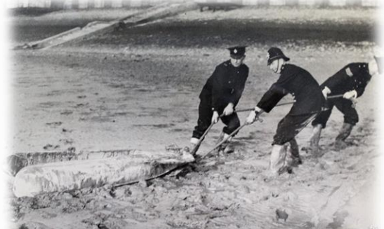
Southend Police removing a defused torpedo from the mud near Southend Pier.

Thanks to the continued dedication of everyone involved in this project, the Bravest Pier in the World Event will be welcoming schools on the Thursday 23 rd and Friday 24 th September and the public on Saturday 25 th and Sunday 26 th September, not just to walk the hallowed boards of Southend Pier, but also to learn about the amazing history of the nearly 200 old structure and meet actors playing people from WW2 Southend and HMS Leigh.